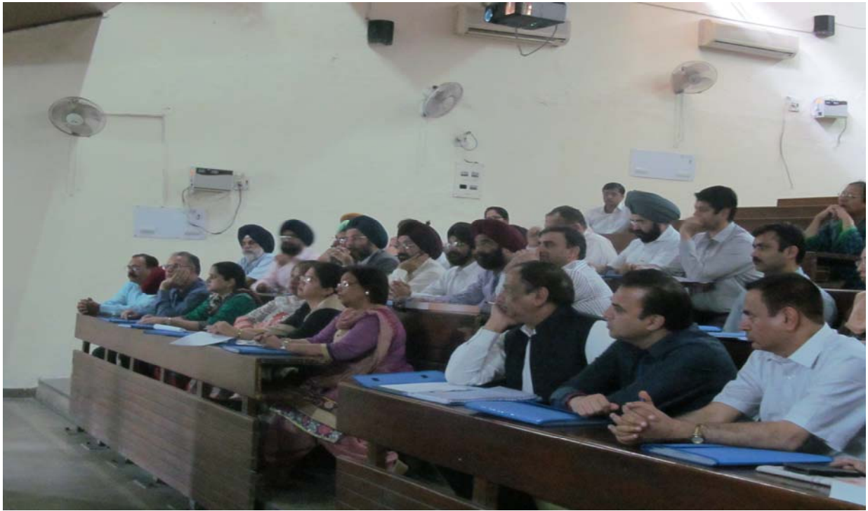
Participants in group session